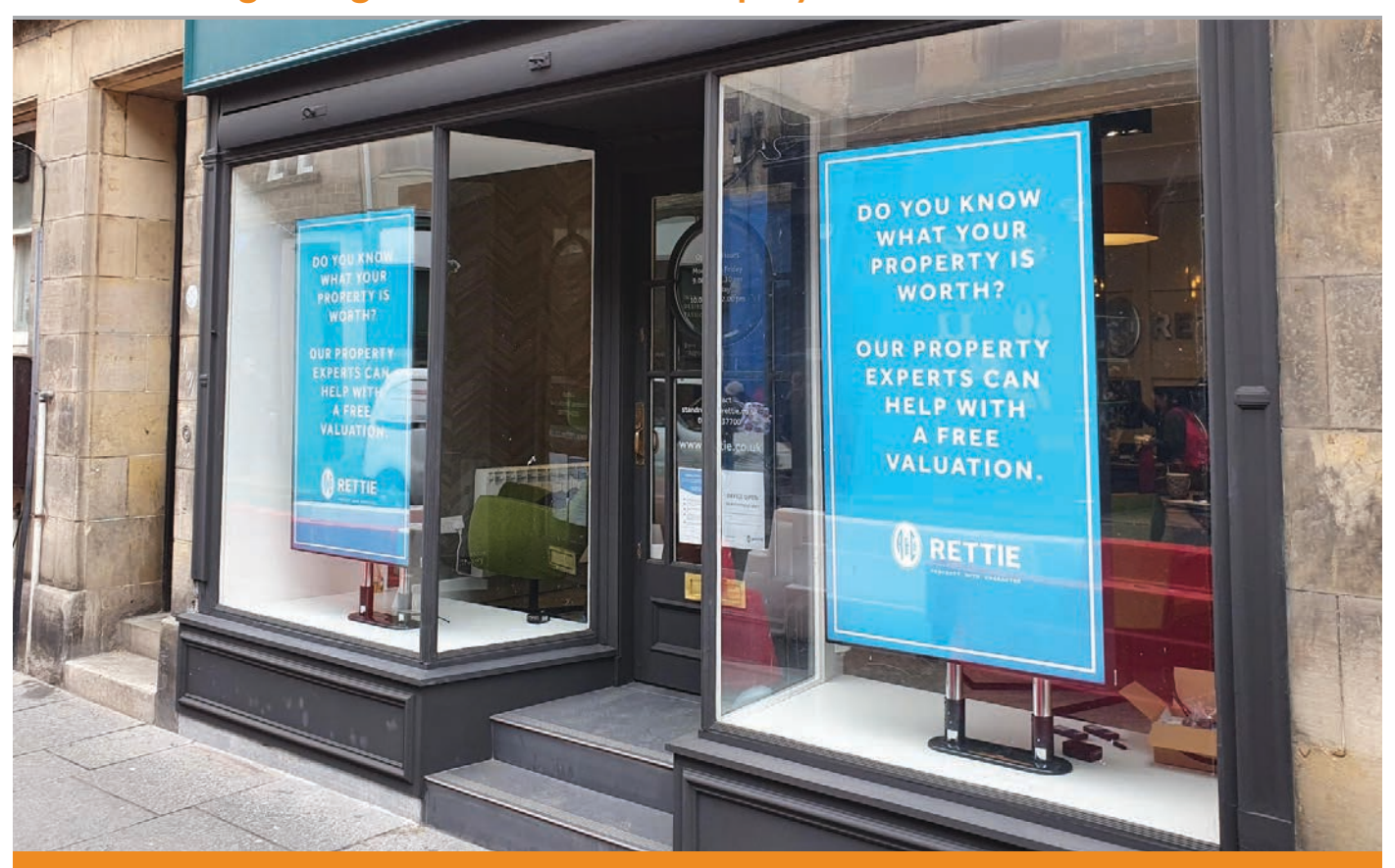
Designed for outward-facing window displays in direct sunlight