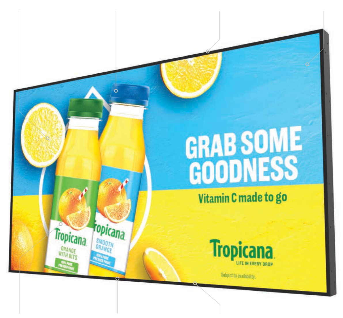
SUPER HIGH CONTRAST RATIO